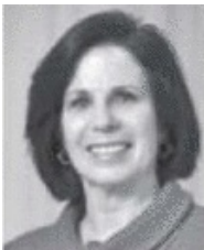
Senior Fellow Project Hope