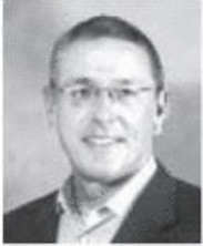
Chairman Jabil Circuit, Inc.