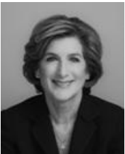
Retired President and CEO Campbell Soup Company