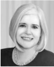
President and CEO Halozyne Therapeutics, Inc.